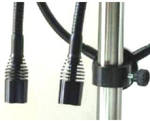
Dual Hi-Power Spots