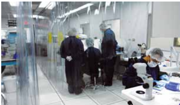
FMI houses clean rooms, fully equipped for silicone mixing, molding, inspection and packaging operations.

The complexity of the parts has increased tremendously. FMI invests in state-of-the-art processes and equipment to deliver the sophisticated ultra-clean silicone product required for surgical implantation. Based on expertise built up over the years, FMI is recognized as a leader in insert molding and bonding of silicone to various substrates.