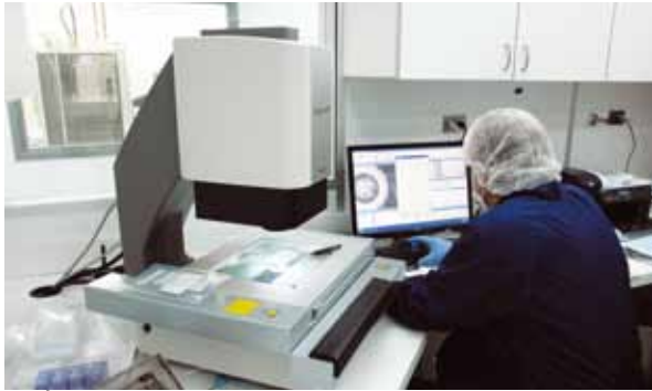
Nikon Metrology iNexiv measurements are used to fine-tune part concepts to ensure optimum moldability.