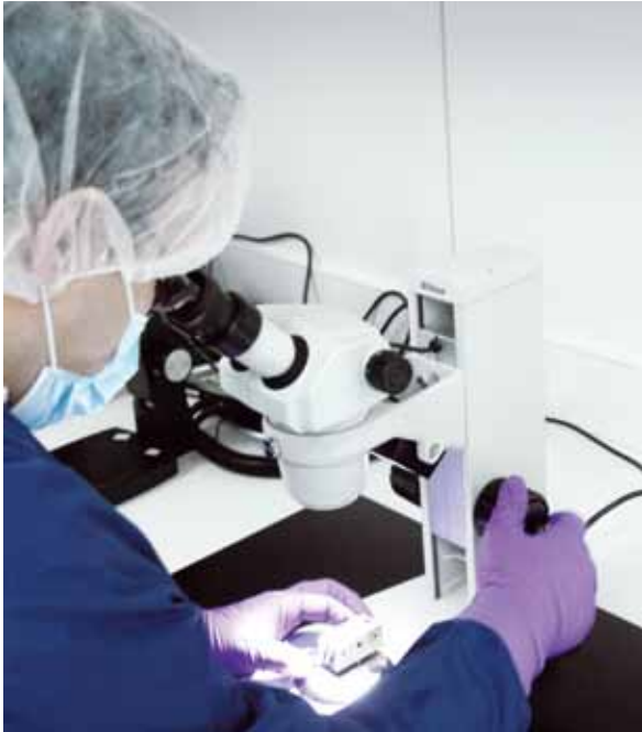
In addition to the iNexiv CNC video measuring system, FMI uses many stereomicroscopes from Nikon.