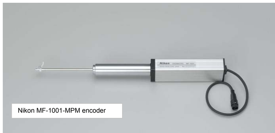
Nikon MF-1001-MPM encoder

Bellows may be purchased for further protection for MF-501 and MF-1001 from dust and oil particles