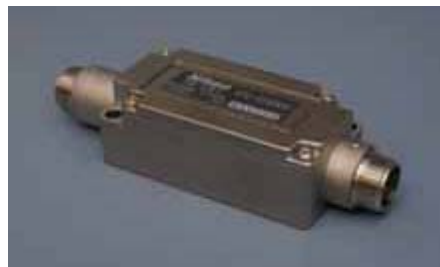
The Nikon VFU-X1600s high resolution interpolator for motion control

The encoder counter board to be connected to the VFU-X1600S A Quad B digital output should be capable of detecting faster than a 5 MHz clock edge for reliable pulse counts. The user must make the connecting cable using the supplied mating connector.