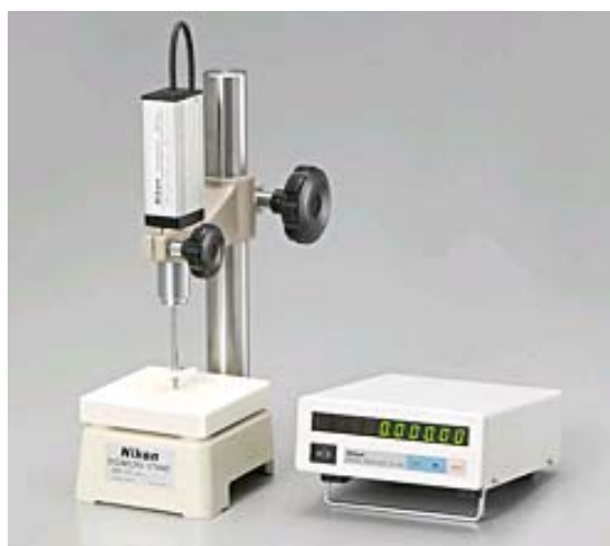
Left: standard ceramic stand for MF1001, shown with the counter (DRO) Nikon TC-101