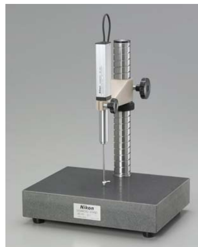
Right: standard granite stand for the MF1001