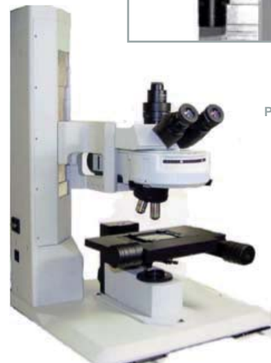
Pro Z stands

Prior Scientific Modular ProZ components offer a wide range of configurations to meet your Z focus and XY microscopy needs. Compatible with Prior ProScan and Optiscan control systems and Lumen and Lumen LED illumination systems. Three different stage mount options are available. A standard BX dovetail is available for basic reflected light applications. For transmitted light applications the ProZ Stand has options for both a brightfield/oblique transillumination module that uses a tiltable sliding mirror or a full Koehler illumination module.