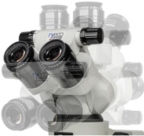
Version Ryeco P-RERGO Super-Ergo Bino-Tilting Binokopf, 0°-180° adjustable