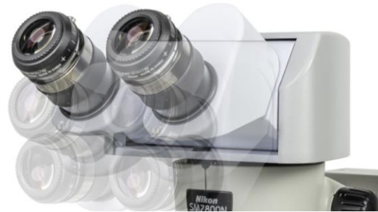
Version Ryeco P-RERG Ergo Bino-Tilting Binokopf, 10°-50° adjustable