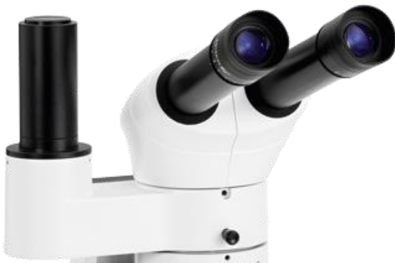
Ryeco Fototubus DSK800