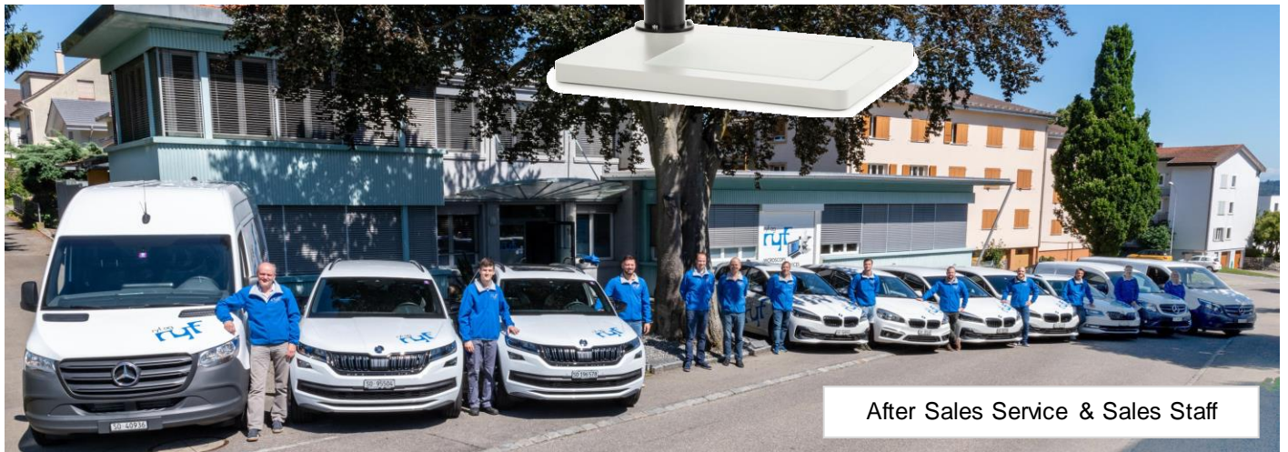
After Sales Service & Sales Staff