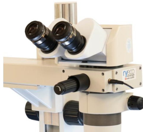
Version Ryeco DSK800 Ergo