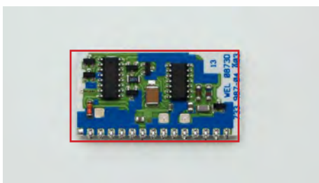
x1 zoom, 2.5x magnification

”Optimized for optical inspection and repair of electronics PCBs”