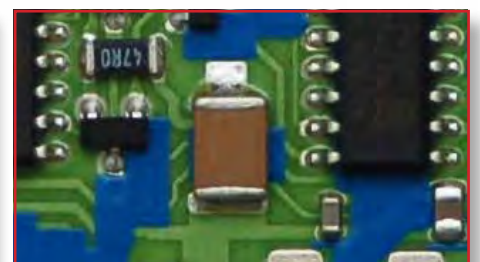
x12 zoom, 30x magnification