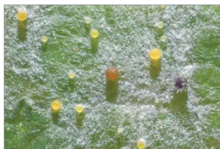
Powdery mildew on Norway maple, cleistothecia, Spot K LED, oblique reflected light, zoom 2.0x